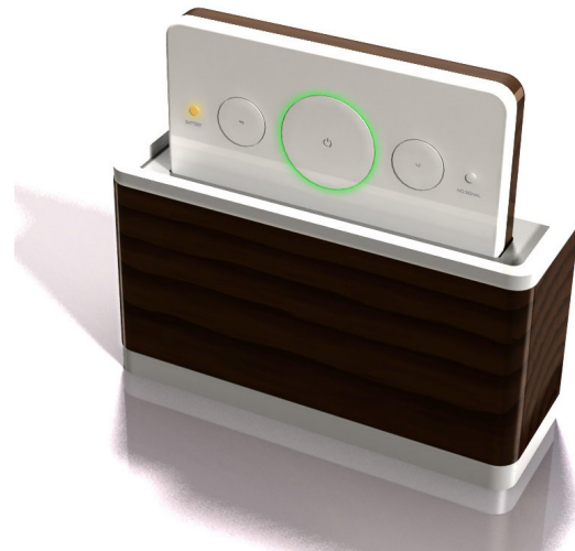
Figure 3. Combined in docking position